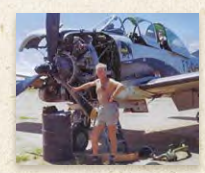
Maintenance for Makasi T-28s was primitive

The CIA planned to have 12 operational T-28s in the Congo. The first 6 T-28Cs arrived in May of 1964. The following September 6 more arrived. The CIA-trained Cuban pilots flew them. The enemy, Communist rebels, were aided by Castro led Cubans and local Simba rebels. The Simbas were cannibals and over the years of conflict, three shot down Makasi pilots were captured and cannibalized by the Simbas. It was a strange time, CIA-supported Cubans fighting Castro-supported Cubans in a remote African Country.