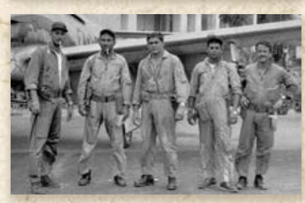
Top: Gear down off-field forced landings often resulted in aircraft flipping. This pilot only had minor arm injuries. Bottom: Makasi pilots

After 1967 the war was declared over. The T-28s were turned over to the new Congo (Zaire) government and flown mostly by mercenaries. By September of 1975 of the 27 T-28s delivered to the Congo, only 8 remained salvageable, only 5 could be made airworthy without a significant rebuild. Of those 5, 3 had seen a LOT of combat. One was T-28C, Bu No 140516, that was in the first group of 6 delivered in May of 1964, 2 in the following September T-28Cs group, 140576 and 140255. Of the 27 T-28s sent to the Congo, these 3 originals from the first year of combat and only 2 others were the only T-28s that were still airworthy.