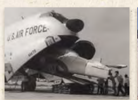
Left: CIA T-28Cs delivered by C-124 Globemaster to the Congo Right: Makasi name and logo

The Cubans, armed with T-28s, quickly turned the tide of the war in the Congo. Their unit took on the name MAKASI (brave and fearless) and the logo of a Bull. (Makasi also just happened to be the name and logo of the local Congo beer.)