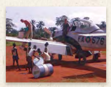
140576 being refueled in Africa on its recovery trip to the U.K.

In 1975 the Congo's government, headed by dictator Mobutu, purchased MB326s - small Italian jet fighters, having no further use for the battle worn T-28s. The T-28s were put up for sale as "lots of 3000 pounds of aluminum" by a Defense Agency in Wiesbaden, Germany. The winning bids for the 5 sort-of-flyable T-28s was Euroworld LTD of London headed by Ted White in September 29, 1975. They paid $1,135.80 for 4T-28Cs and $1,512.90 for the 1T-28 D5.