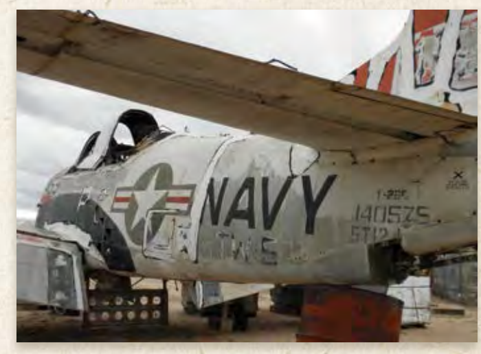
T-28C 140575 in private lot next to Davis-Monthan Boneyard, was always a Navy Trainer, the plane on the line right behind it was 140576 which was sent to Congo and flies today in airshows across the U.S.

landing trainer. After it had accumulated over 2,000 carrier landings it was sent for an IRAN overhaul. The CIA had armed it in 1964, having sent it to the Congo inside a C-124 Cargomaster. While in the Congo it flew combat missions for 1800 hours over the next 11 years. March 19, 1965 was a particularly bad day for 140576. Its logs read: Bullet hole through nose wheel door R/H, pilots cockpit floor, green sun shield and canopy. And the log goes on to list 7 more bullet holes in the right and left wings. It was repaired and returned to service. It was one of the three that returned to the US and was initially restored by John Ellis of Kalamazoo, MI.