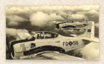
T-28 Bu. No 140516 and 140576 while in Belgium Congo, both would beat the odds and be returned to the U.S. and are flying today.

Unfortunately, as most T-28s have traded hands over the years, many of their original log records and stories have been lost. But each T-28 has a story. T-28 owners know they are just the keepers of their Trojans until someday