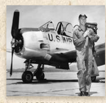
U.S.A.F. T-28A and training. Note two bladed propeller.

with black lettering. Today they carry many different authentic military color schemes that the T-28s wore over their many decades of military service. The T-28s are so shiny and oil free, they conceal the decades of mishandling by new military student pilots and some hide the damage suffered from being in combat. But each Trojan that will be on the Oshkosh ramp found someone willing to secure, restore, maintain and care for it. Each has a story to tell. Some of those stories will be told at "Warbirds in Review" sessions during Air Venture that will featuring the T-28 and its many roles: as a trainer, a combat fighter, a Reno Racer and an airshow aircraft.