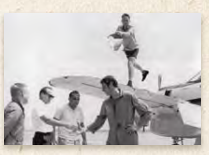
Some traditions never change. Newly Checked out Makasi T-28 Trojan Pilot gets splashed.

for the last 16 years. It is part of the 6 ship Trojan Thunder formation aerobatic team. Its logs are typical of the Makasi T28s. After leaving the North American factory in Columbus, Ohio it spent 9 years being a Navy carrier