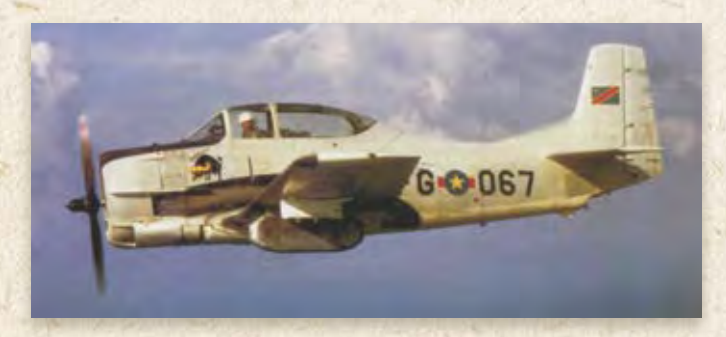
Look Ma, no tail hook! Tail hooks were removed, and cowl strakes were added to allow spin recovery with armaments on combat T-28Cs.

the CIA war against the communist rebels in the Congo. The CIA had trained Cuban pilots for the Cuban Bay of Pigs Invasion. That invasion didn't go too well, but the Cuban pilots were still ready and willing to fight communists anywhere in the world. The CIA needed them in the Congo.